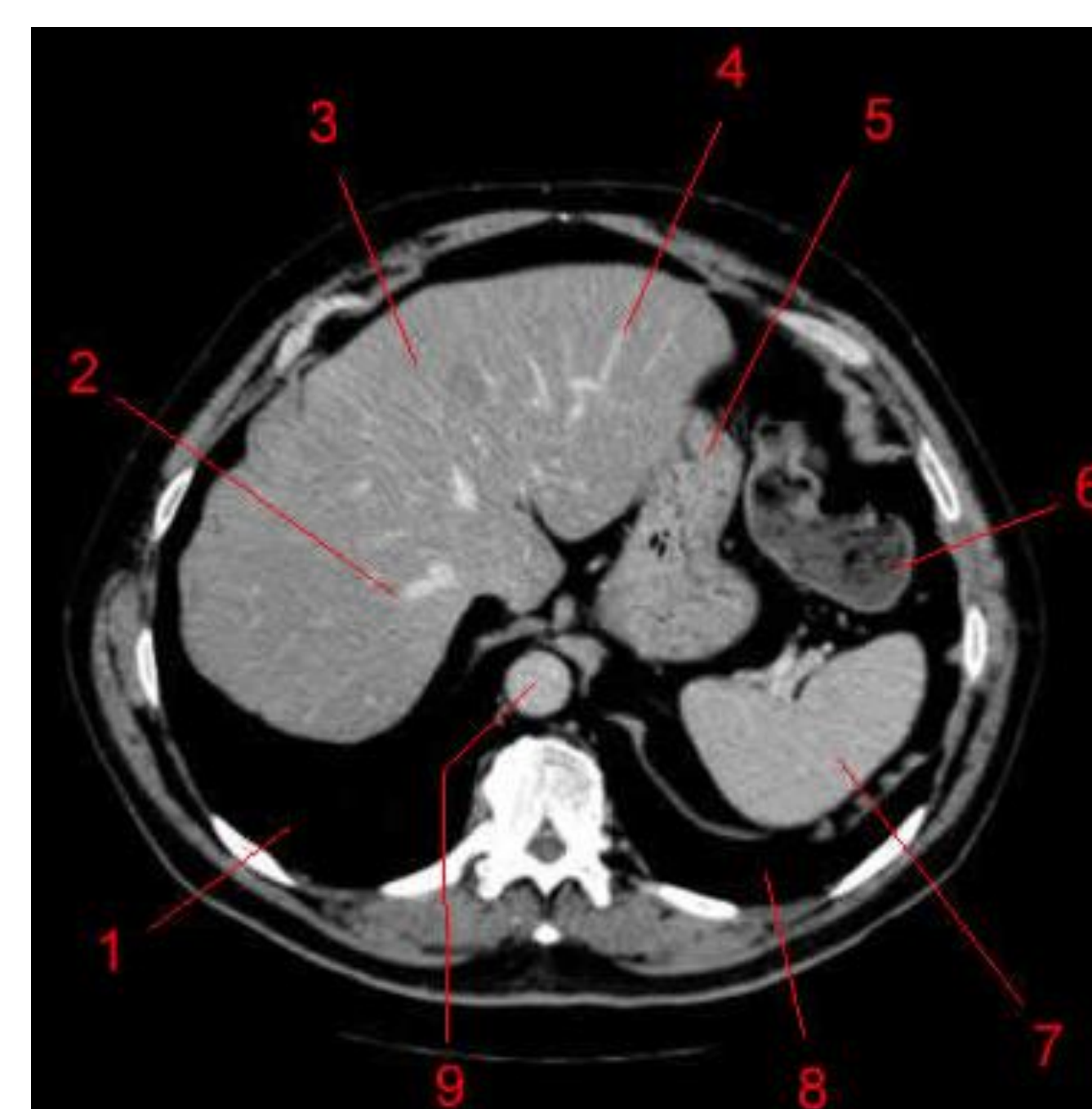
Fig. 4 – Automatic image annotation of a cross-section view of the abdomen [6].