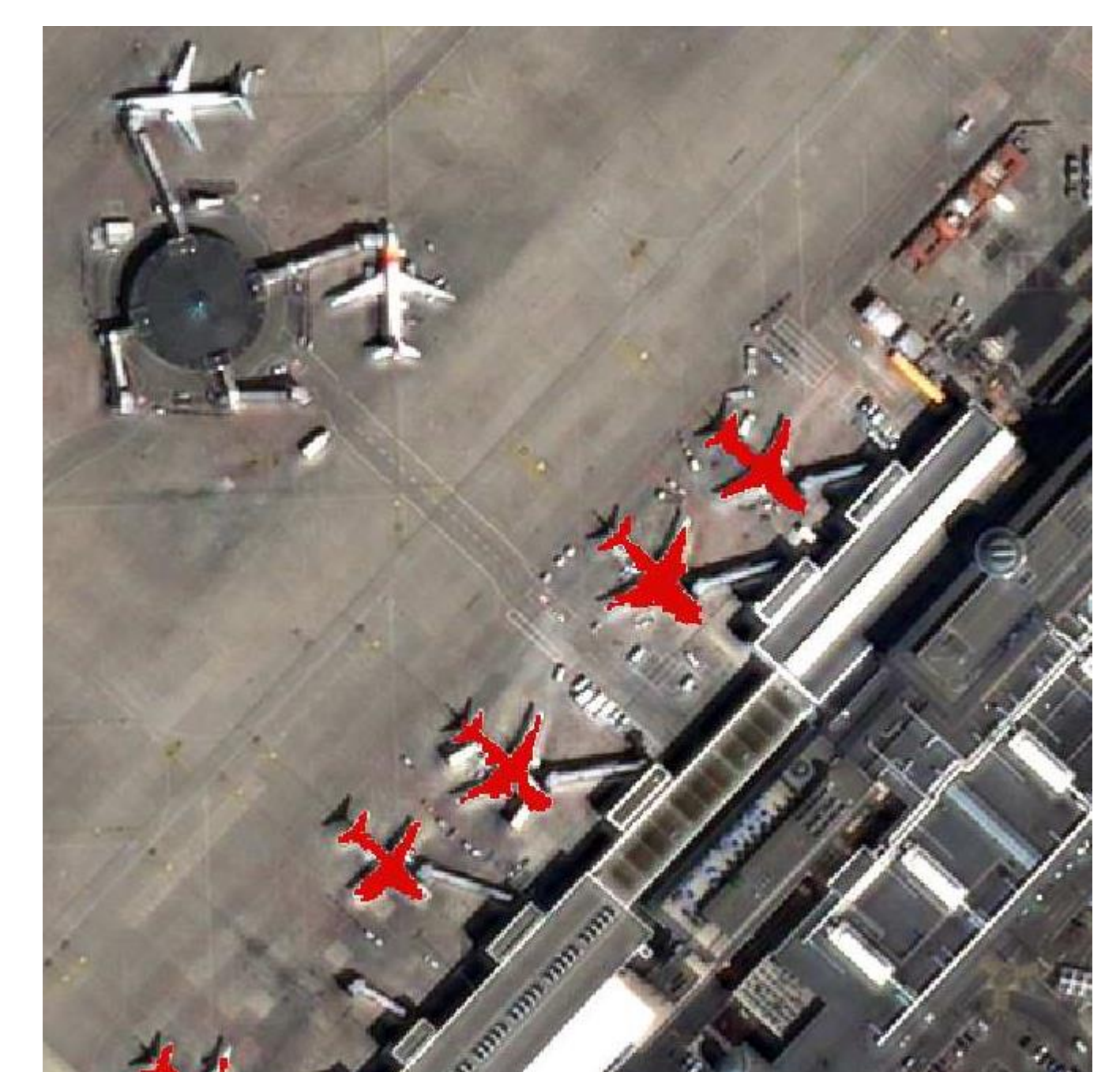
Fig. 5 – Detection of an alignment of planes [7].