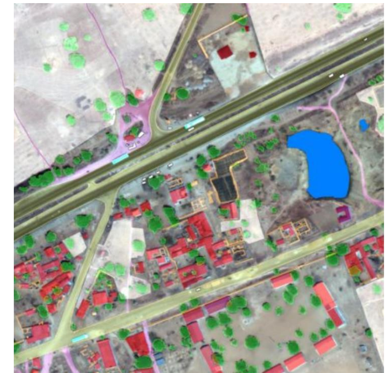
Fig. 2 – Before learning relations, images are segmented [3].